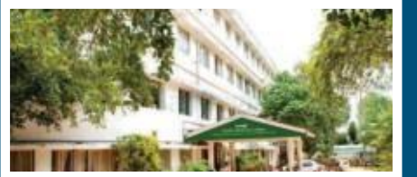
Santhigiri Siddha Medical College, Thiruvananthapuram