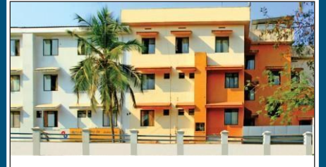
KMCT Ayurveda Medical College, Calicut