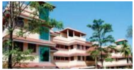
Mannam Ayurveda Co-operative Medical College, Pandalam