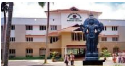
Pankajakasthuri Medical College, Thiruvananthapuram