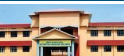
Sree Narayana Institute of Ayurvedic Studies & Research, Puthur, Kollam