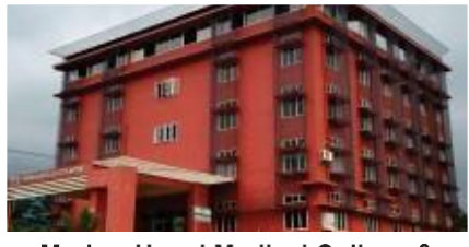
Markaz Unani Medical College & Hospital, Kozhikode