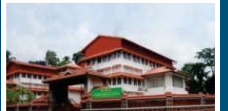
P.N.N.M Ayurveda Medical College, Shoranur