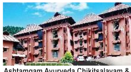
Ashtangam Ayurveda Chikitsalayam & Vidyapeedham (AACV), Vavanoor