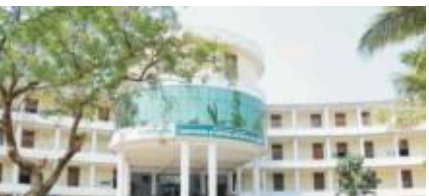
Santhigiri Ayurveda Medical College, Palakkad