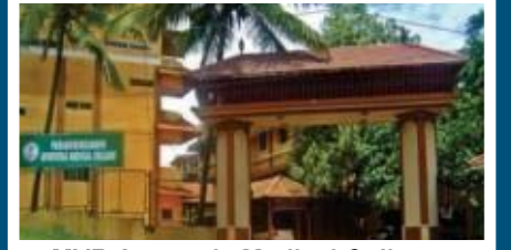
MVR Ayurveda Medical College Parassinikadavu, Kannur