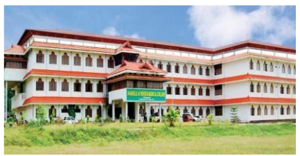
Nangelil Ayurveda Medical College, Kothamangalam